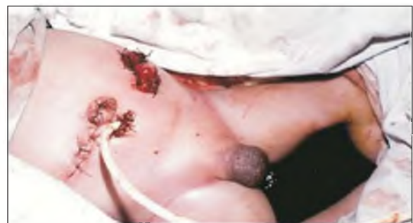
Figure 1: Photograph showing absent penis, suprapubic vesicostomy & sigmoid colostomy

At laparotomy, segmental dilatation of sigmoid colon was found, 6 cm in length with normal caliber of sigmoid colon proximally and distally. Urinary bladder was also distended. Colostomy, proximal to dilated sigmoid colon, vesicostomy and repair of umbilical cord hernia was performed (Figure 1).