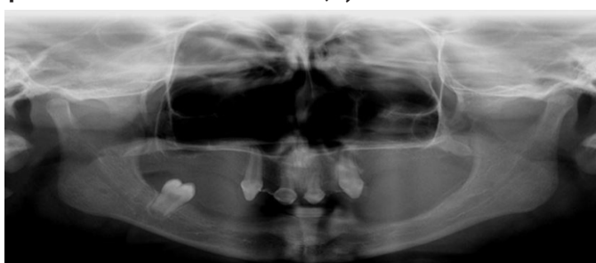
Figure 2: Orthopantomogram of the patient at age of 8 years