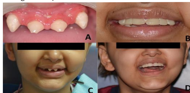
Figure 3: Pre insertion and post insertion pictures

Patients with ectodermal dysplasia require a multidisciplinary strategy for treatment planning and dental treatment to restore social well-being, esthetics and function. Only Prosthetic support was used in this case since it did not require help of any other dental specialty at the moment. Provision of removable dentures is a rational, feasible and economic option at this age of the patient.